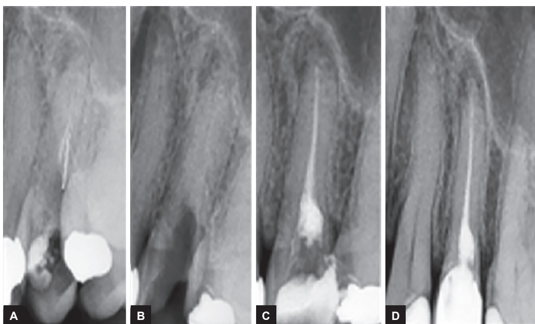
Figs 1A to D: (A) Preoperative view; (B) after instrument retrieval using ultrasonic; (C) after obturation; and (D) recall after 6 months

A 20-year-old female patient came to the department with the complaint of pain while chewing in lower right back tooth for past 1 month. She had given a history of root canal treatment in affected tooth 3 months earlier in another clinic. There was no relevant medical history. Intraoral examination revealed metal ceramic crown in relation to 46 with tenderness on percussion. Intraoral periapical radiograph of 46 showed incomplete obturation on the mesiolingual canal and there was an instrument