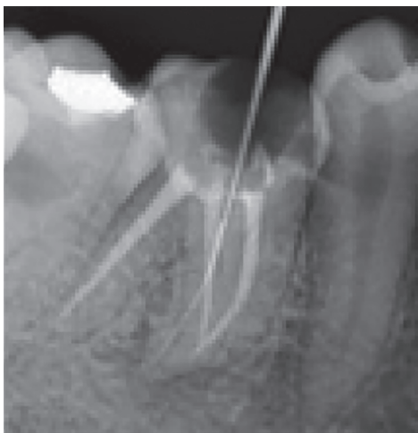
Fig. 4: Obturated distobuccal, distolingual, mesiolingual canal and bypassed separated instrument in mesiobuccal canal