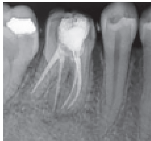
Fig. 5: Postoperative composite followed by crown placement

fracture in the mesiobuccal canal as distinguished by tube shift technique. There was an additional distolingual root. The distobuccal root was under-obturated and the distolingual root was unobturated. Radiolucency was seen at the periapical aspect of mesial root and one distal root (Fig. 2). Treatment plan was to go for root canal retreatment in relation to 46.