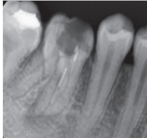
Fig. 3: After gutta-percha removal—separated instrument in one of the mesial canals