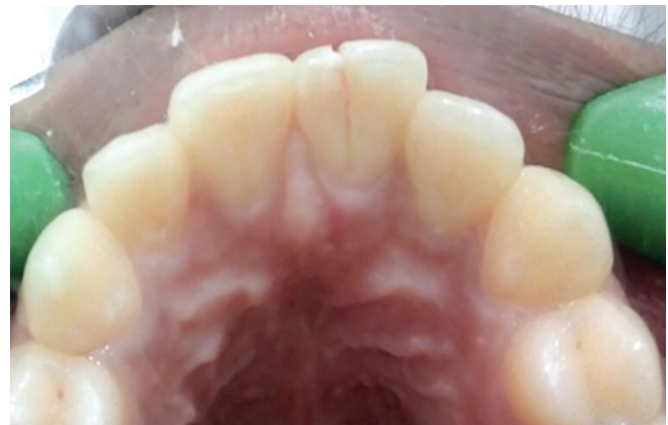
Fig. 2: Preoperative palatal view