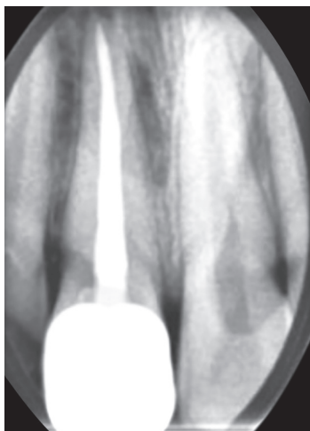
Fig. 7: Follow-up after 18 months

need for endodontic therapy, location, extension of fracture, quality of fit between fragments, and the fracture pattern. In the case presented, the fracture is from the incisal tip to cervical third extending vertically, and the fragments were not separated. Bonding of the fracture was preferred in the initial visit because patient was at a younger age and also it retains the natural esthetics since there is minimal area of intervention.