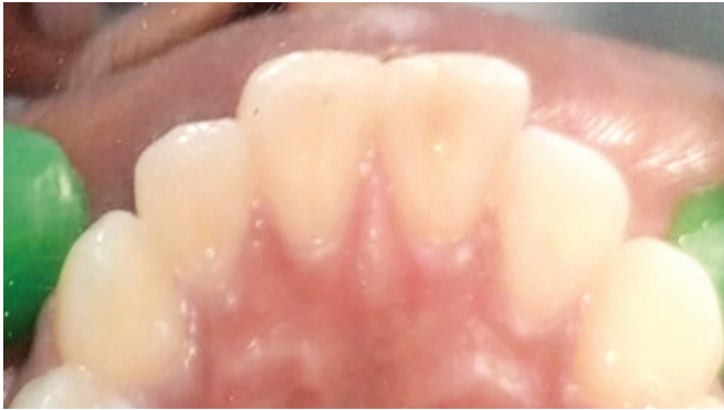
Fig. 5: Postoperative palatal view