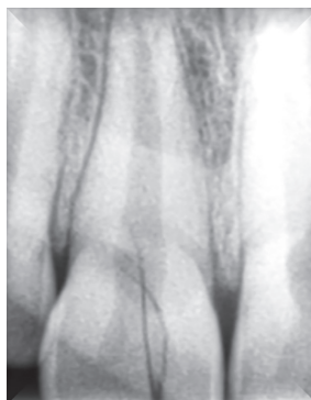
Fig. 3: Preoperative radiograph