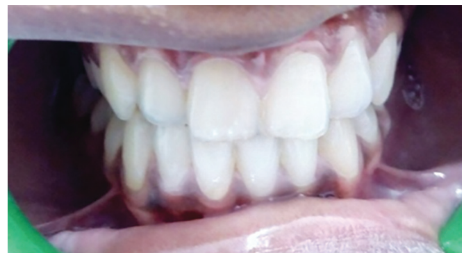
Fig. 4: Postoperative labial view