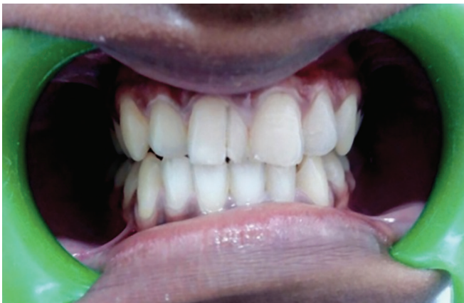
Fig. 1: Preoperative labial view

Management of traumatic injuries has always been a challenge for treatment. Proper diagnosis, treatment, and follow-up care are required to ensure the best possible outcome. The introduction of CBCT helps in diagnosis of root fractures with high accuracy and sensitivity. 10 Factors that might influence the choice of technique include the