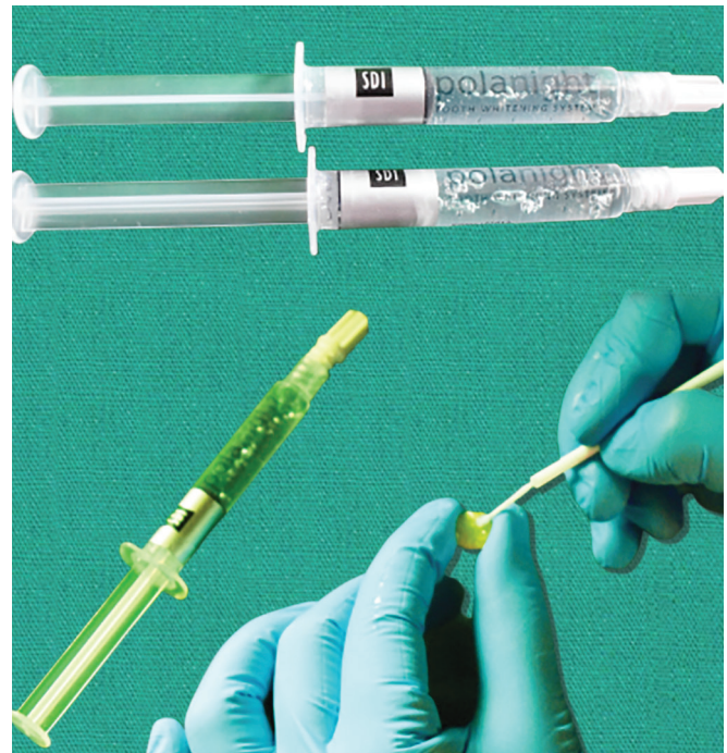
Fig. 4: Whitening treatment by Polanight