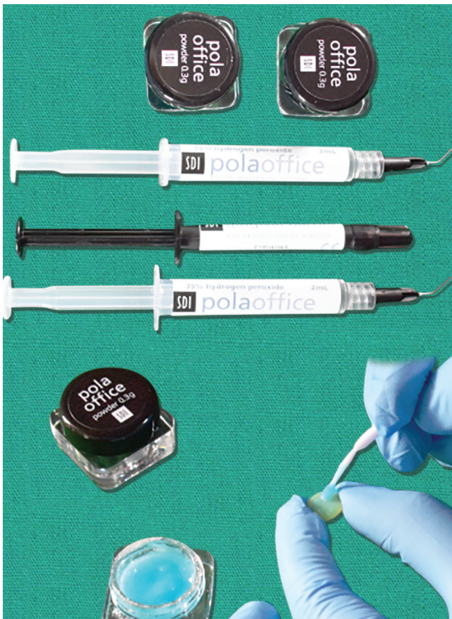
Fig. 5: Whitening treatment by Polaoffice