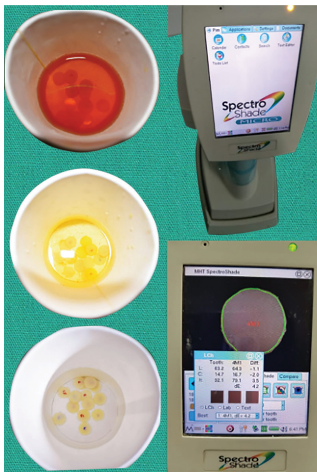
Fig. 2: Staining methods and spectrophotometer

Multiple comparison between subgroups was done using the Tukey HSD test. Pairwise comparisons were significant between all subgroups except between subgroups B and D (polanight and polish) in the coffee staining group. In the turmeric group, subgroup A (crest 3D white toothpaste) showed statistically significant difference with all the other groups ( p < 0.05 ) (Table 4).