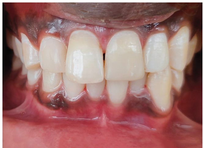
Fig. 8: Review after 18 months