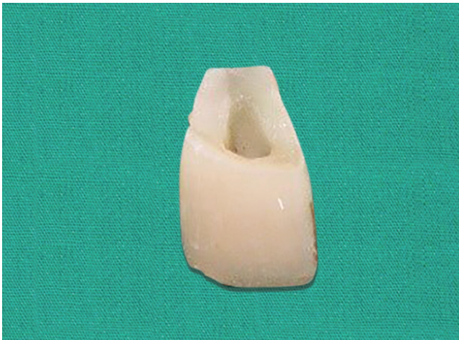
Fig. 5: Fractured fragment