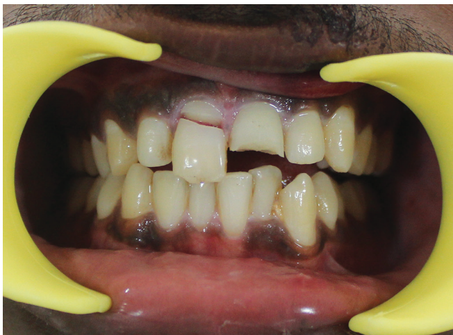
Fig. 1: Preoperative view of teeth 11 and 21—labial aspect

The management of the trauma depends upon the line of fracture and the amount of the remaining tooth structure. Whenever the fractured segment is available and intact, reattachment is a better approach. For a complicated fracture, root canal treatment is indicated and the pulp space is used for reinforcement. If the fractured segment is missing, the management depends upon the available tooth structure. When there is sufficient coronal structure, composite can be bonded to the crown. Proper instructions should be given after the treatment since even a minor impact can again fracture the crown.