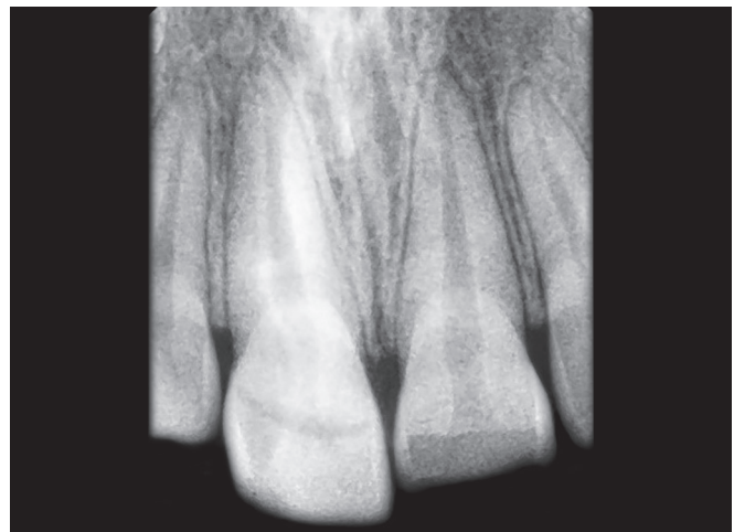
Fig. 2: Preoperative radiographic view