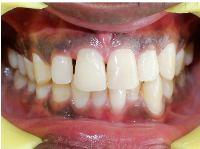
Fig. 7: Postoperative picture after fragment reattachment in 11 and restoration of missing portion with composite in 21