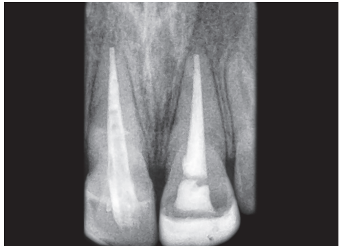
Fig. 6: Postoperative radiograph after fragment reattachment