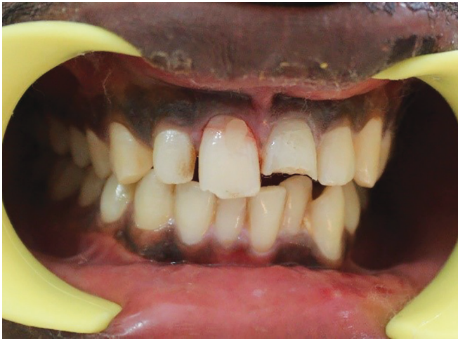
Fig. 3: Composite splinting of fragment