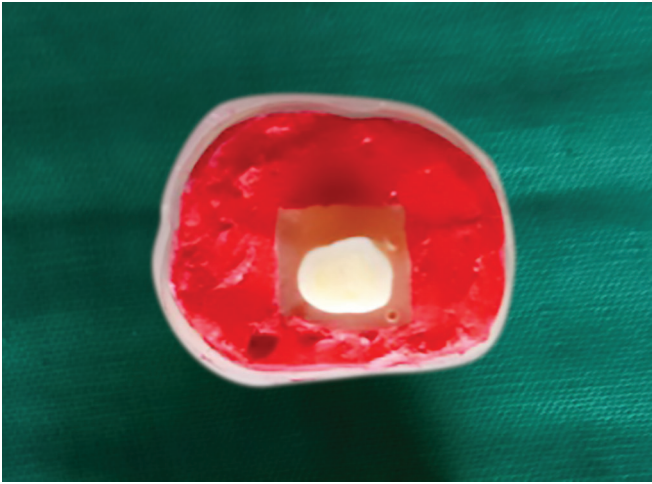
Fig. 1: Mounting specimens

products (e.g., Ketac Molar, 3M/ESPE, Seefeld, Bavaria, Germany; Chemflex, Dentsply, York, Pennsylvania, USA; Fuji IX and Fuji IX GP, GC International) were well known for their use in small cavities in deciduous teeth, temporary restorations, liner/base applications, and in the "Atraumatic Restorative Treatment" technique. 11 Ketac™ Universal Glass Ionomer Restorative is an innovative initiative by 3M ESPE Dental. The manufacturer claims that the material does not require preconditioning of the cavity for sufficient bonding. Thus, steps in restoration placement are reduced but compressive strength and surface hardness are not compromised, and reported to be more than several clinically proven glass ionomers that require a coating. The current study aims at comparing the adhesiveness of newly marketed Ketac Universal with Ketac Molar and Fuji IX.