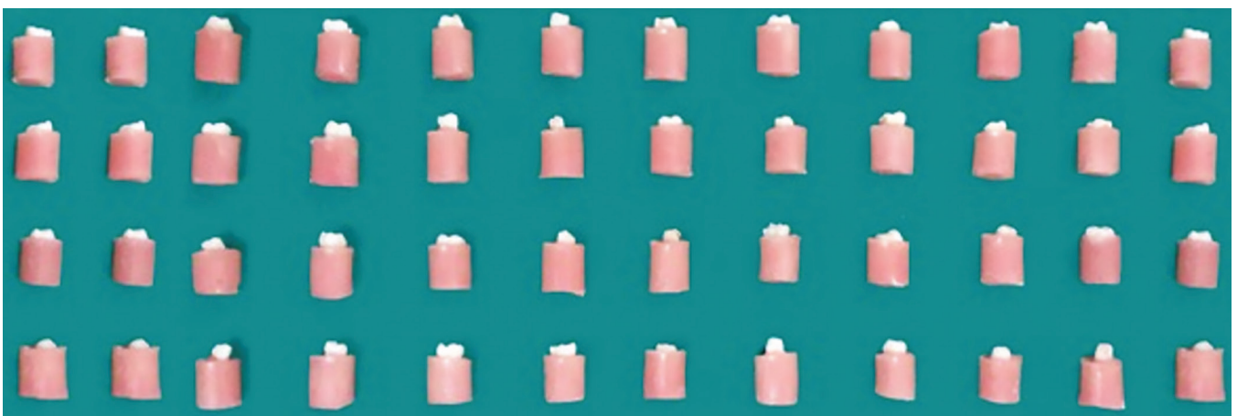
Fig. 2: Specimens embedded in acrylic

Each specimen was loaded in a universal testing machine (INSTRON) with a crosshead speed of 0.5 mm/min (Fig. 3). The bond strength (in MPa) was calculated by dividing the shear force in Newton (N) by the area of adhesion.