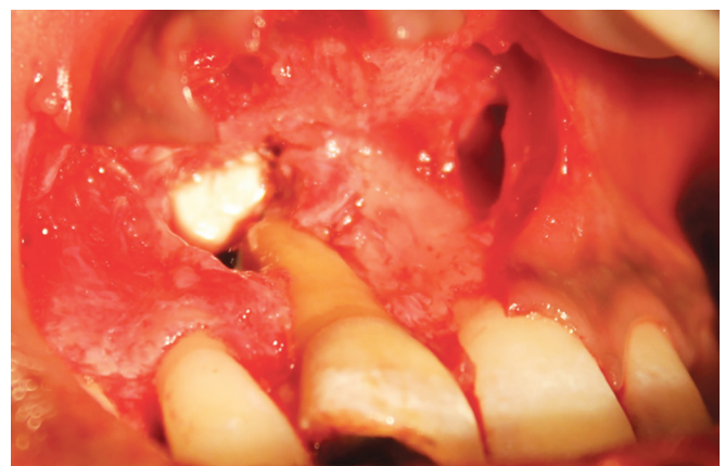
Fig. 4: Bone defect was filled with antibiotic-infused hydroxyapatite crystals