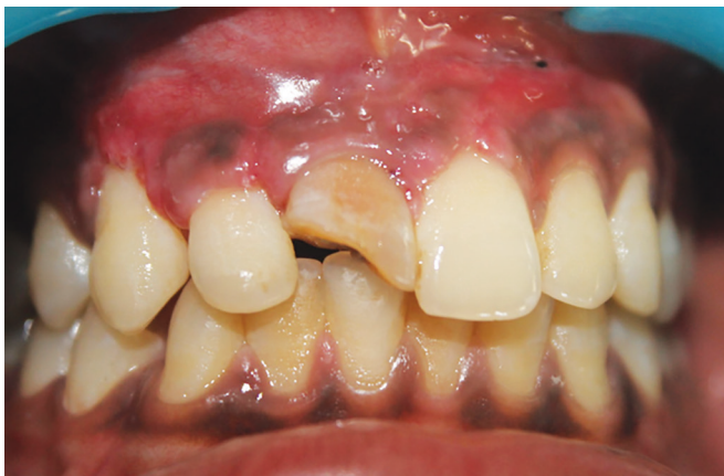
Fig. 5: After 1 week review, the wound was completely healed