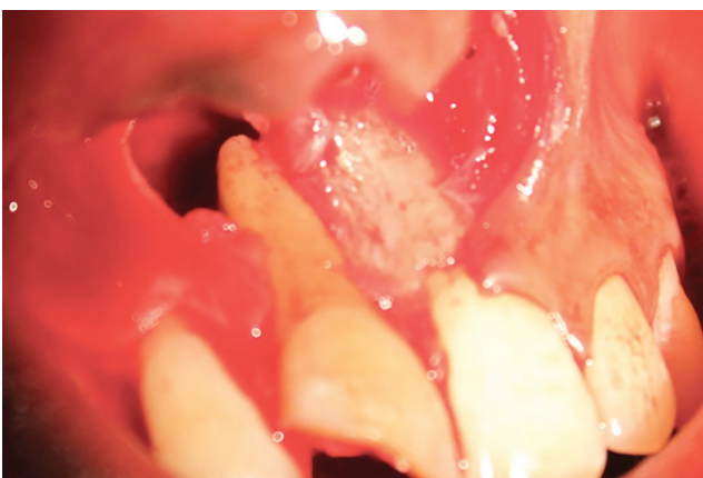
Fig. 3: Cyst was enucleated followed by apicoectomy and retrograde filling was placed with biodentin

thermoplasticized gutta-percha on the day of surgery. After administration of local anesthesia, a full thickness mucoperiosteal flap was reflected and irrigated with normal saline. Large buccal bone resorption was present on the site. Complete curettage and enucleation of cyst was done. Then apical 3 mm of the roots was resected for 11, and the retrograde filling was done with biodentin (Septodont, France) (Fig. 3). Bone loss was evident with respect to 11, bone defect was filled with antibiotic-infused hydroxyapatite crystals (Fig. 4). Closure of flap was done with 3-0 silk following hemostasis. The granulation tissue was sent for histopathological examination, and histopathology report confirmed the diagnosis of an infected radicular cyst. On 1 week review, wound was healed (Fig. 5) and full coverage restoration was given after 1 month. At 1-year follow-up, a radiograph was taken in relation to maxillary right central and lateral incisors, which confirmed the satisfactory healing of periapical lesion (Fig. 6).