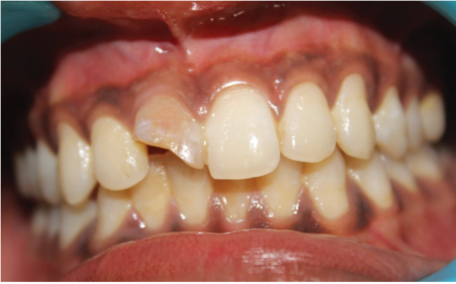
Fig. 1: Preoperative photograph shows Ellis class II fracture and discoloration on 11 and sinus opening

2 years back and had previous history of pain and swelling for which no treatment was sought. Clinically, there was Ellis class II fracture with discoloration on 11 and sinus opening was present (Fig. 1). Vitality was checked, and 11 and 12 showed no response to thermal and electrical pulp testing. Preoperative periapical radiograph revealed a large well-defined periapical radiolucency in relation to 11 and 12. Gutta-percha tracing through sinus revealed the lesion mainly extended around 11 (Fig. 2). Based on the above findings, it was provisionally diagnosed as an infected periapical cyst leaving the definite diagnosis for histopathological analysis.